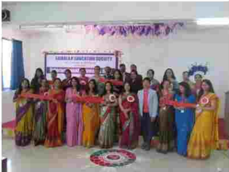
Recipients of women archiver awards