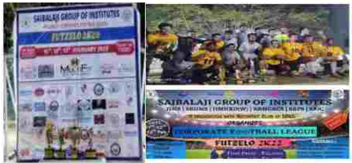
DIRECTOR IIMHRD (W) PUNE

Outcome: learn sportsmanship, team building, fitness, competitive spirit. Participants: 90