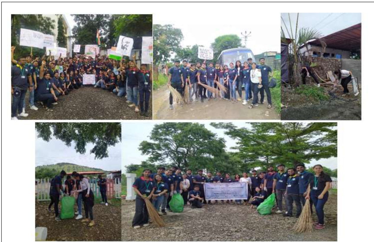
Swachhata Abhiyan on the occasion of Gandhi Jayanti, Rotaract Club of SBES planned and executed Cleanliness Drive at Kasarsai Dam on 2nd October 2022