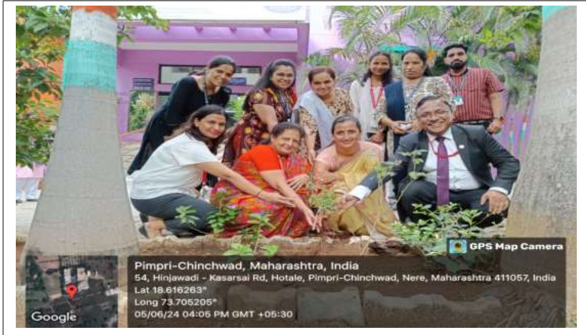
Tree Plantation by Faculty members on the occasion of World Environment Day