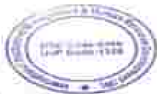
DIRECTOR IIMHRD (W) PUNE